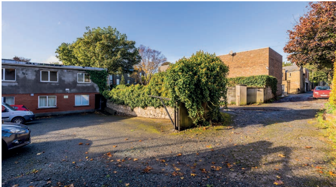
Rear yard accessed from Orchard Lane