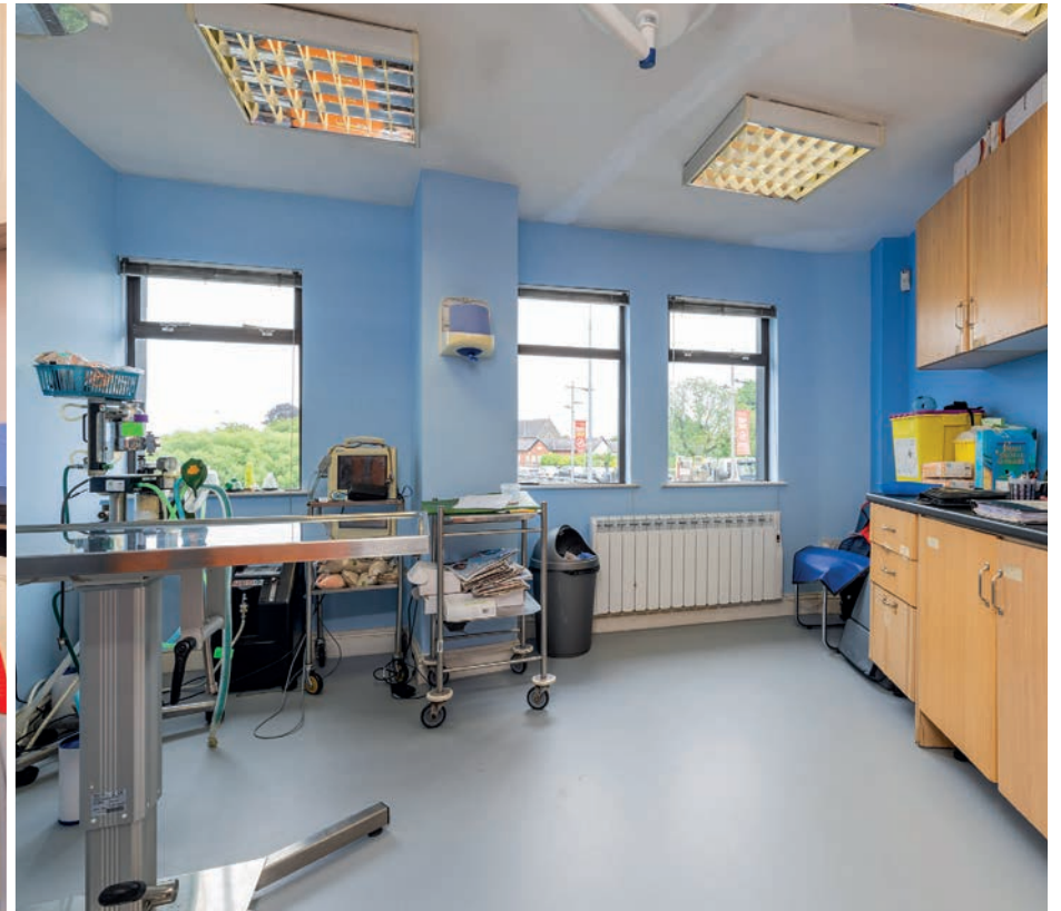
Unit 3 Blue Vet Veterinary Clinic