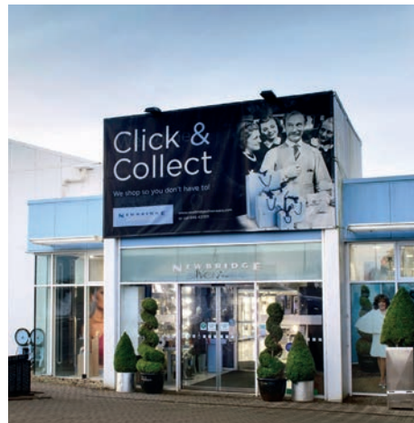
Newbridge Railway Station