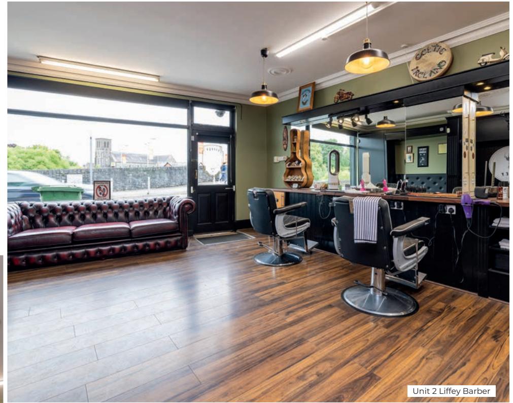
Unit 2 Liffey Barber

The subject property presents in good condition/repair with three tenants operating from the units.