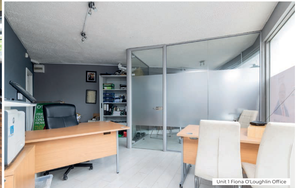
Unit 1 Fiona O'Loughlin Office