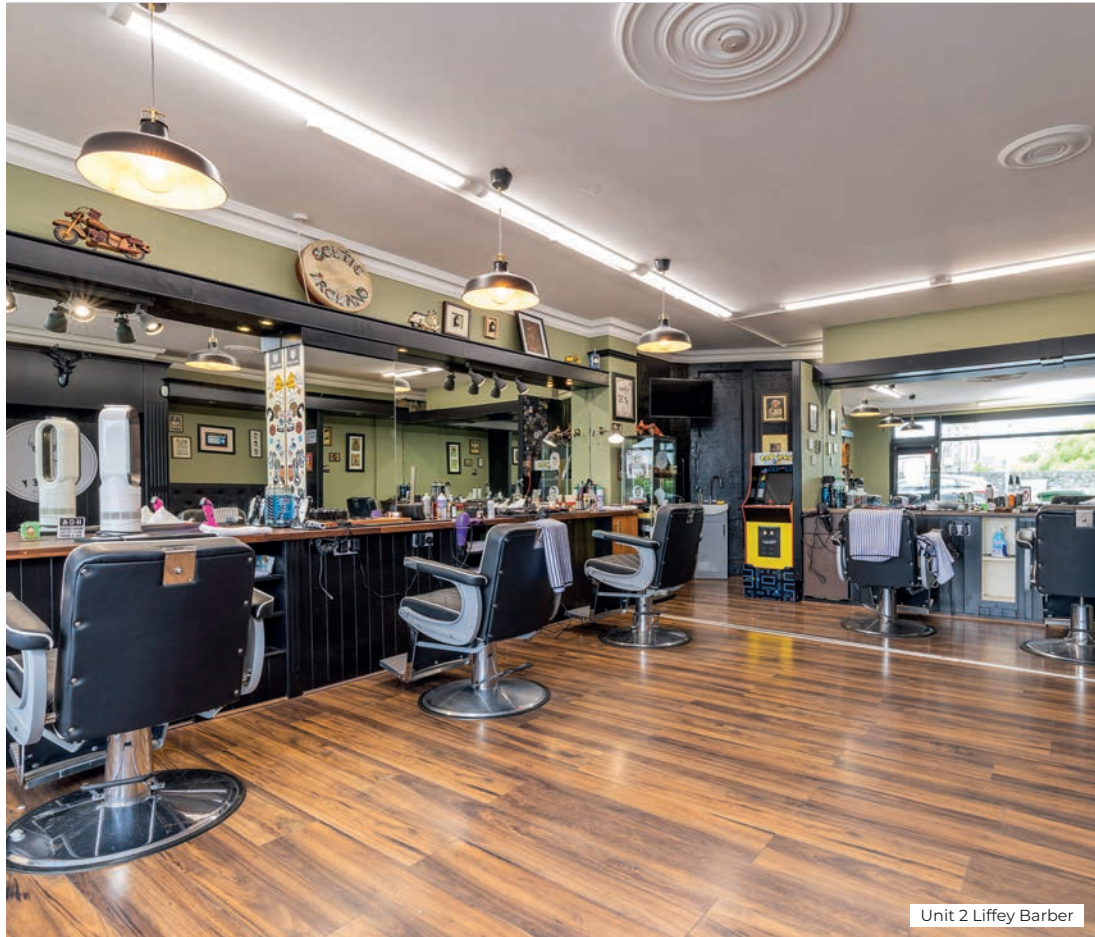
Unit 2 Liffey Barber