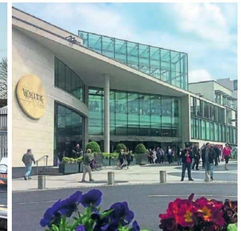
Whitewater Shopping Centre