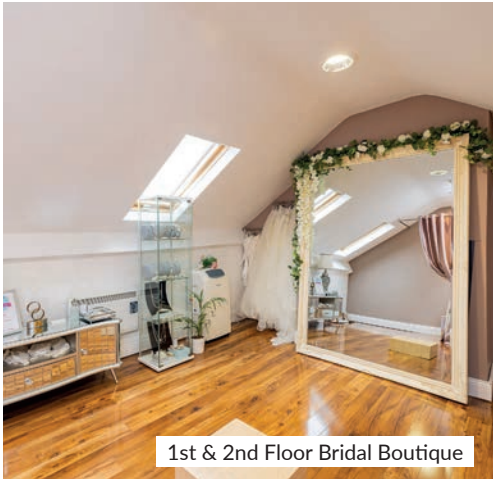
1st & 2nd Floor Bridal Boutique