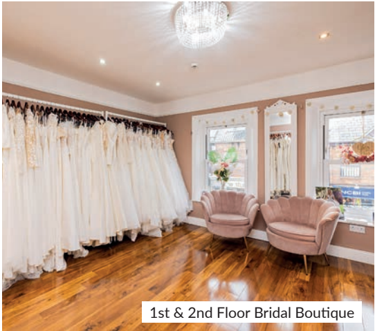
1st & 2nd Floor Bridal Boutique