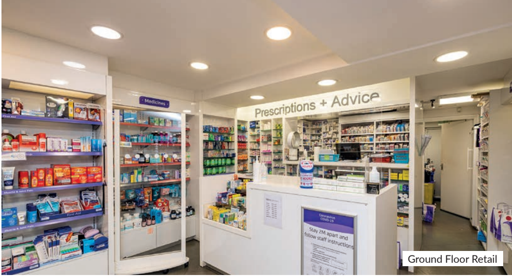
Ground Floor Retail