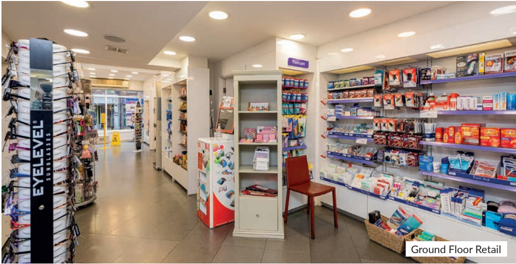
Ground Floor Retail