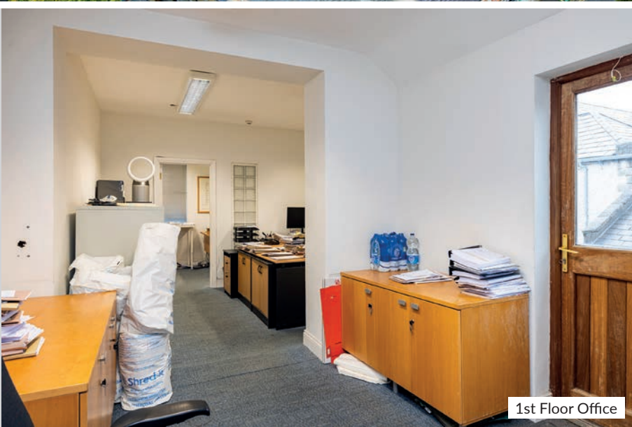
1st Floor Office