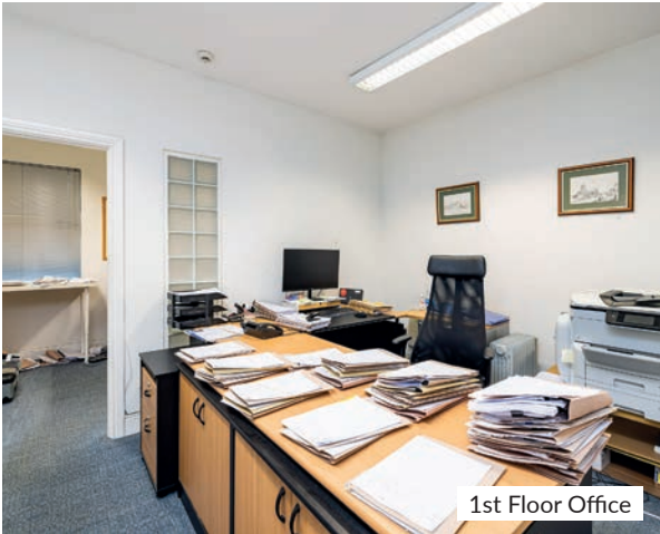
1st Floor Office