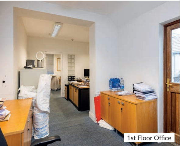
1st Floor Office