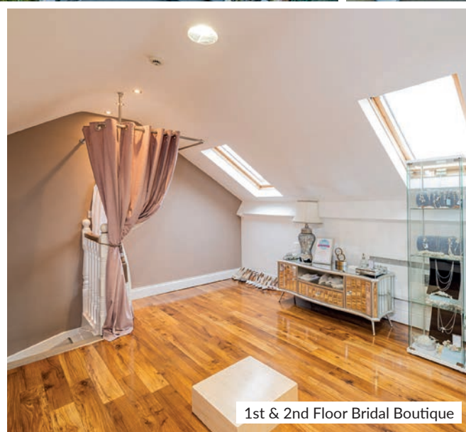
1st & 2nd Floor Bridal Boutique