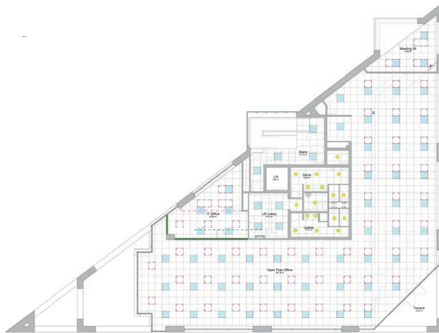
1 Second Floor Level 1 : 100