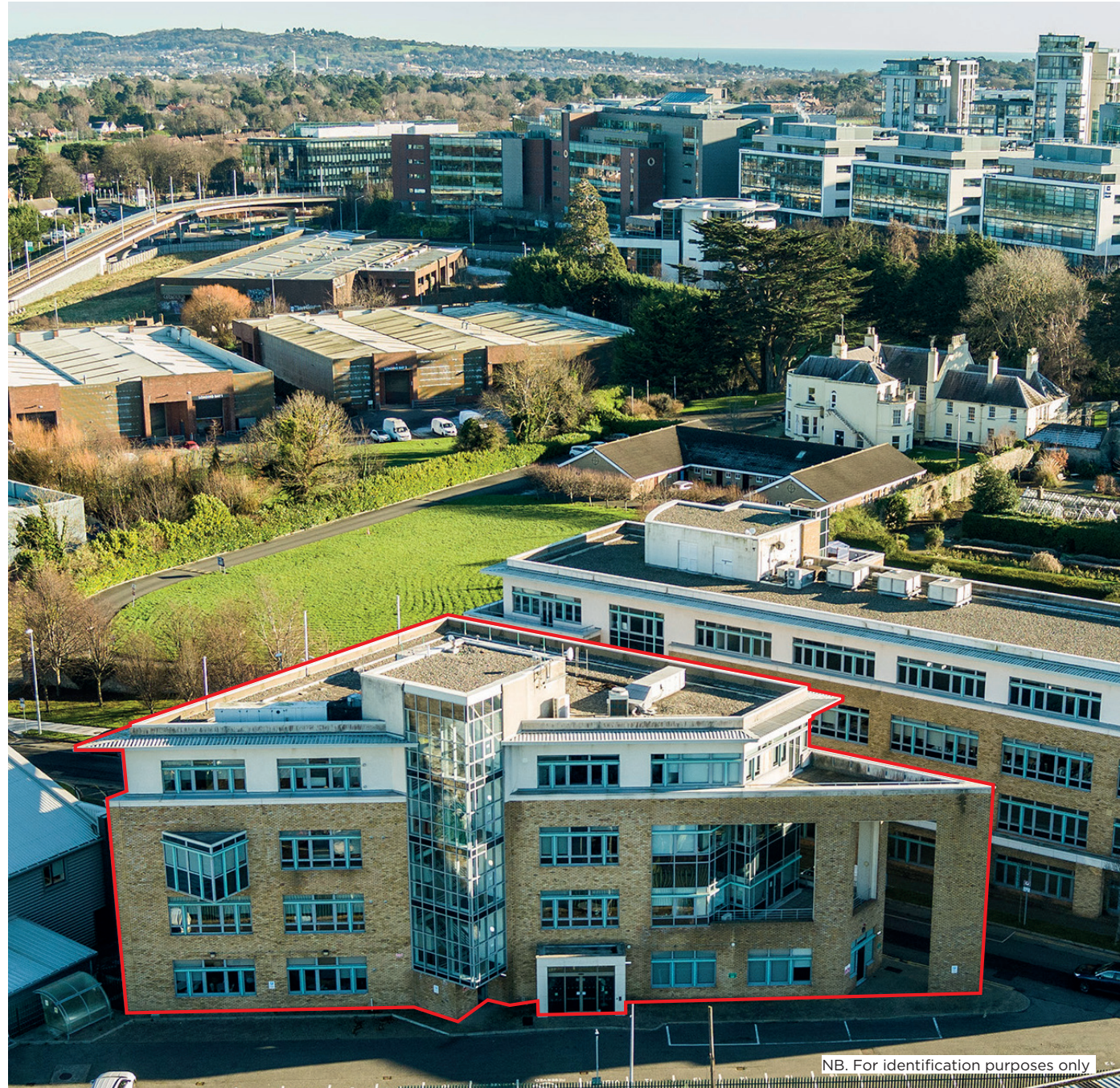
NB. For identification purposes only