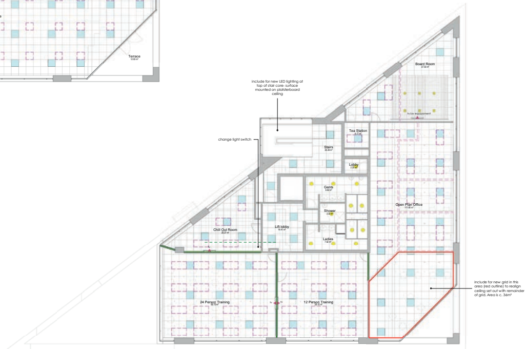
2 Third Floor Level 1 : 100